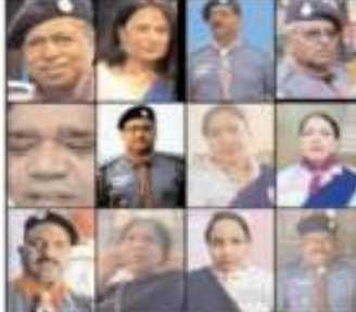
कार्यशाला में भाग ले रहे स्काउट गाइड और अधिकारियों की तस्वीरें।

राज्य स्तरीय ऑनलाइन स्काउट गाइड शैक्षिक नवाचार कार्यशाला का किया गया आयोजन।