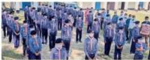
कमिटी को निर्देशित हुए मतदाताओं की सेवा के लिए तैनात हुए स्काउट गाइड।

सिद्धिचौरी | इंदौर भारत विधानसभा चुनाव 2020 में द्वितीय चरण के चुनाव में वैशाली जिले के 6 विधानसभा में विद्यमान उभरे हुए मतदाताओं की सेवा के लिए स्काउट गाइड को तैनात किया जा रहा है। जिले के 6 विधानसभा क्षेत्र में स्काउट गाइड को तैनात करने के लिए निर्देश जारी करे गए हैं। स्काउट गाइड को तैनात करने के लिए निर्देश जारी करे गए हैं। स्काउट गाइड को तैनात करने के लिए निर्देश जारी करे गए हैं।