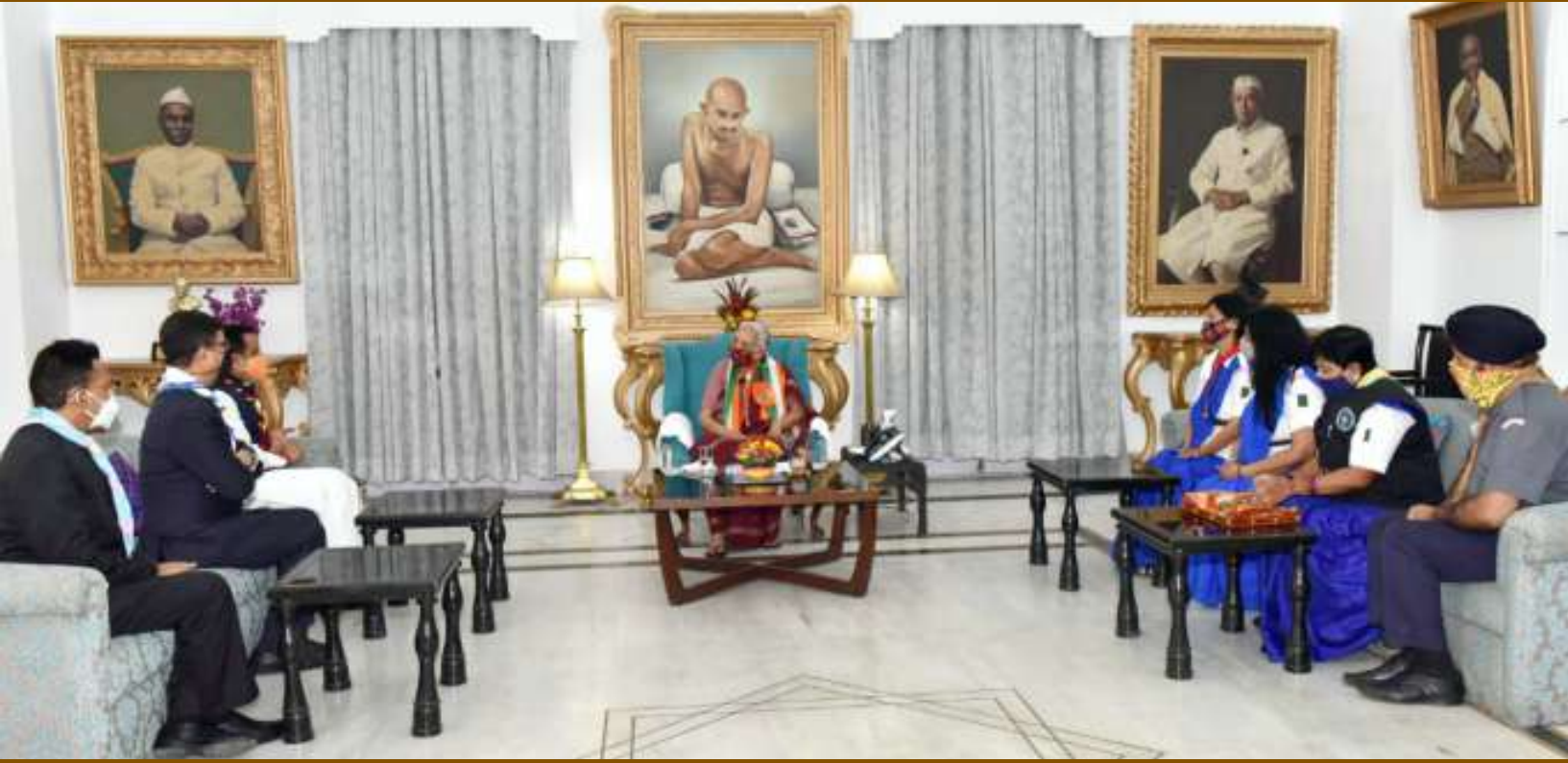
H.E. Smt. Anandiben Patel, Governor of Uttar Pradesh felicitated by officials of Uttar Pradesh State Bharat Scouts and Guides on 07 th November, 2020 to commemorate 70 th Foundation Day of The Bharat Scouts and Guides.