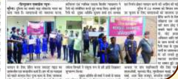
स्काउट गाइड ने निःशर्कता कायदा जलदोष कल्याण