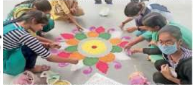
बोरोपूर। राजस्थान राज्य स्काउट गाइड संस्थान में बालिकाओं ने नो मास्क नो एंट्री अभियान में बालिकाओं की सुरक्षा एवं सम्पन्न के लिए जागरूकता कार्यक्रम में रंगोलियां बनाईं।