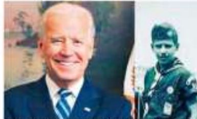
US President-elect Joe Biden. (Right) As a young scout.